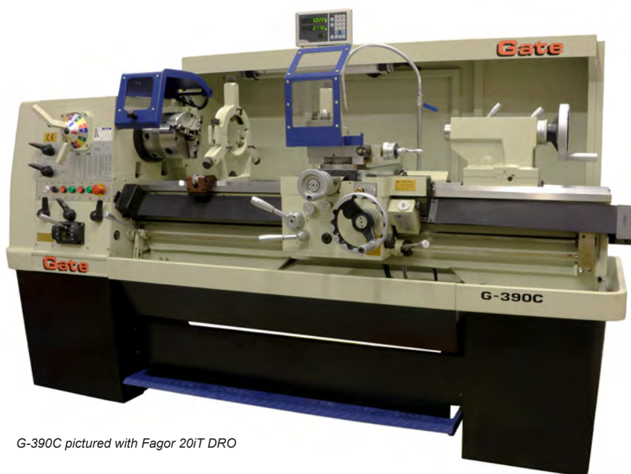
G-390C pictured with Fagor 20iT DRO